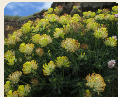
Kidney Vetch Anthyllis vulneraria Méara Muire

Yellow Rattle is a delightful wildflower that is semi-parasitic in nature, (obtains partial nutrition from other plants). When the seed capsule dries and is shaken, it gives a rattle-like sound due to the seeds held within it. Flowers from: May- September.