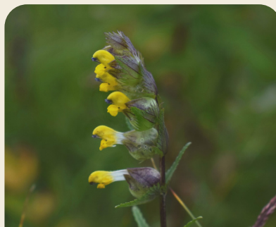
Yellow Rattle Rhinanthus minor Glioghrán

Dodder is a fascinating plant. It lacks chlorophyll and obtains its nutrition solely from other plants, which it parasitizes. Dodder lacks leaves and is more easily recognized by its twine-like red stems, than its bell-shaped pink/white flowers. Overall, this is a very rare plant across all of Ireland. Around the Maharees it can be found growing on the dunes and slacks. Flowers from: July- September.