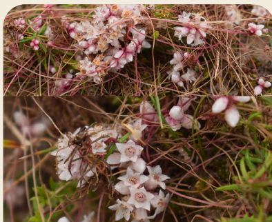
Dodder Cuscuta epithymum Clamhán

Squincywort has a very restricted distribution in Ireland and is predominantly found along the western seaboard, (Galway to Kerry), with few records from other parts of Ireland. The flowers are a delicate pink colour. Around the Maharees it can be found growing on dunes. Its name comes from its historical medicinal use to treat quinsy (infection of the tonsils). Flowers from: June- September.