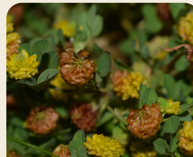
Hop Trefoil Trifolium campestre Seamair dhuimhche

As its name suggests, Wild Thyme is a fragrant herb that has a distinctive aromatic smell when crushed and is still used in cooking today. Wild Thyme can be found growing on dunes and heaths and, when in full bloom, puts on an impressive display with its distinctive mauve-purple flowers. Flowers from: June-October.