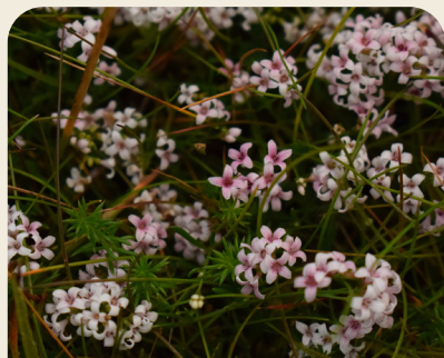
Squincywort Asperula cynanchica Lus na haincise

MTU Ollscoil Teicneolaíochta na Mumhan Munster Technological University