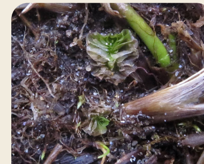
Petalwort (liverwort) Petalophyllum ralfsii Lus na bpeiteal

Identified by its globular yellow flower heads, which are composed of numerous small pea flowers, Hop Trefoil stands out distinctly against the dunes and dry grasslands. Leaves are trifoliate and lack tips. Flowers from: June-September.