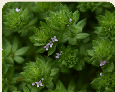
Field Madder Sherardia arvensis Dearg faille

A delightfully striking species that grows happily on sand dunes, though never in large quantities. Bright yellow flowers are born on long stalks. Striping along the centre of the lower petals leads pollinating insects to the centre of the flower. Flowers from: April- October.