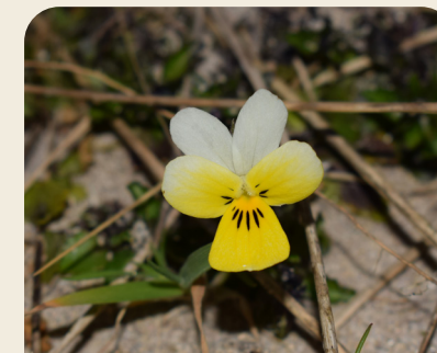
Sand Pansy Viola tricolor subsp. curtisii Goirmín duimhche

Historically, Kidney Vetch was thought to heal kidney ailments as the shape of the flower somewhat resembles that of a kidney. The usual colour form is yellow but red, pink and orange forms occur. An important plant for the Small Blue butterfly whose caterpillars feed exclusively on this species. Flowers from: June- September.